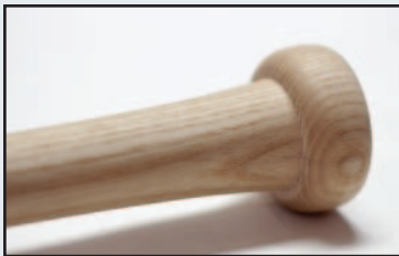
Classic Knob (Left) Tapered Knob (Right)

MEASUREMENTS: Get as specific as you like, we'll match them! Or, just keep it general.