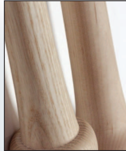
Untreated Ash (Left), Untreated Maple (Right)

MAPLE: Hard Maple has a very tight grain structure, which give the bat rigidity and strength. Because of the wood density, Maple bats tend to be heavier than Ash, and are considered to be more durable. When stained, the grain is muted.