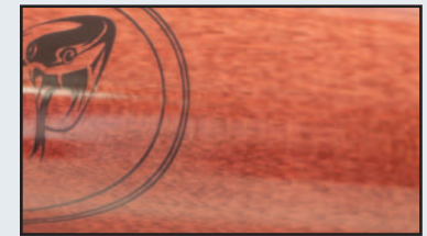
Ash, Sedona Red (Top), Maple, Sedona Red (Bottom)